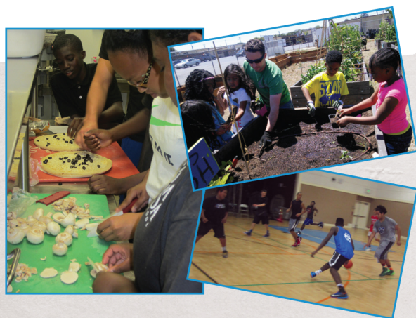
Project Health is our comprehensive health and wellness programs focusing on developing healthy habits in our members.