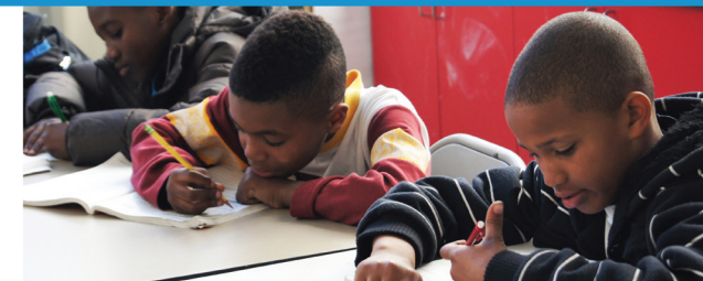
Members participate in Power Hour: an after-school homework assistance program that encourages them to learn to work independently and feel positive about their school accomplishments.