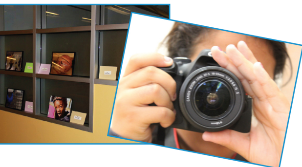
Members learn and practice black-and-white, color, digital and alternative process photography in the ImageMakers Photography Club.