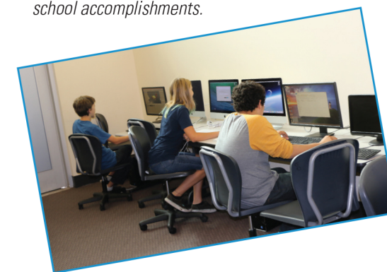
Members participate in various Science, Technology, Engineering & Math programs like coding and game development.