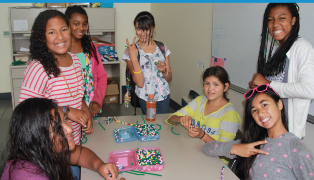
SMARTGirls provides female members ages 8-17 with guidance toward healthy attitudes and lifestyles.